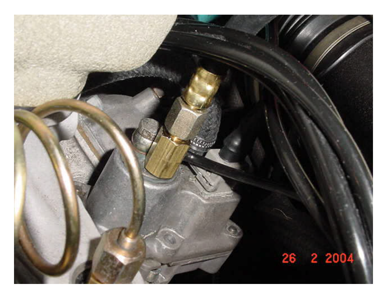
My pressure gauge line then attached to the T-fitting using a snap-collar type lock: